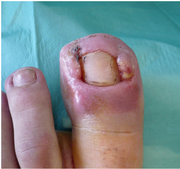
Fig. 1. Clinical appearance showing chronic onychocryptosis in stage V. The cellulitis of both nail borders can be observed.

Although postoperative wound infection is a potential complication of dermal surgery, Hirschmann stated that the occurrence in dermatologic surgery is too infrequent to justify the use of systemic antibiotic prophylaxis, except in special circumstances [19]. These special cases include patients with numerous staphylococcal skin infections or recurrent cellulitis. Some podiatric references have shown the need for appropriate treatment of infection in cases of developed chronic onychocryptosis accompanied by cellulitis and radiological signs of periostitis or osteomyelitis (Figs. 1 and 2) [15,20]. The authors emphasize the need for a proper radiological monitoring of possible osseous manifestations if the progress of the infection is adverse after an empirical antibiotic treatment, and recommend the carrying out of drainage, bone resection, and culture and antibiogram, followed by the administration of specific antibiotics until the infectious process remits, maintaining them for at least two weeks [14–16,20].